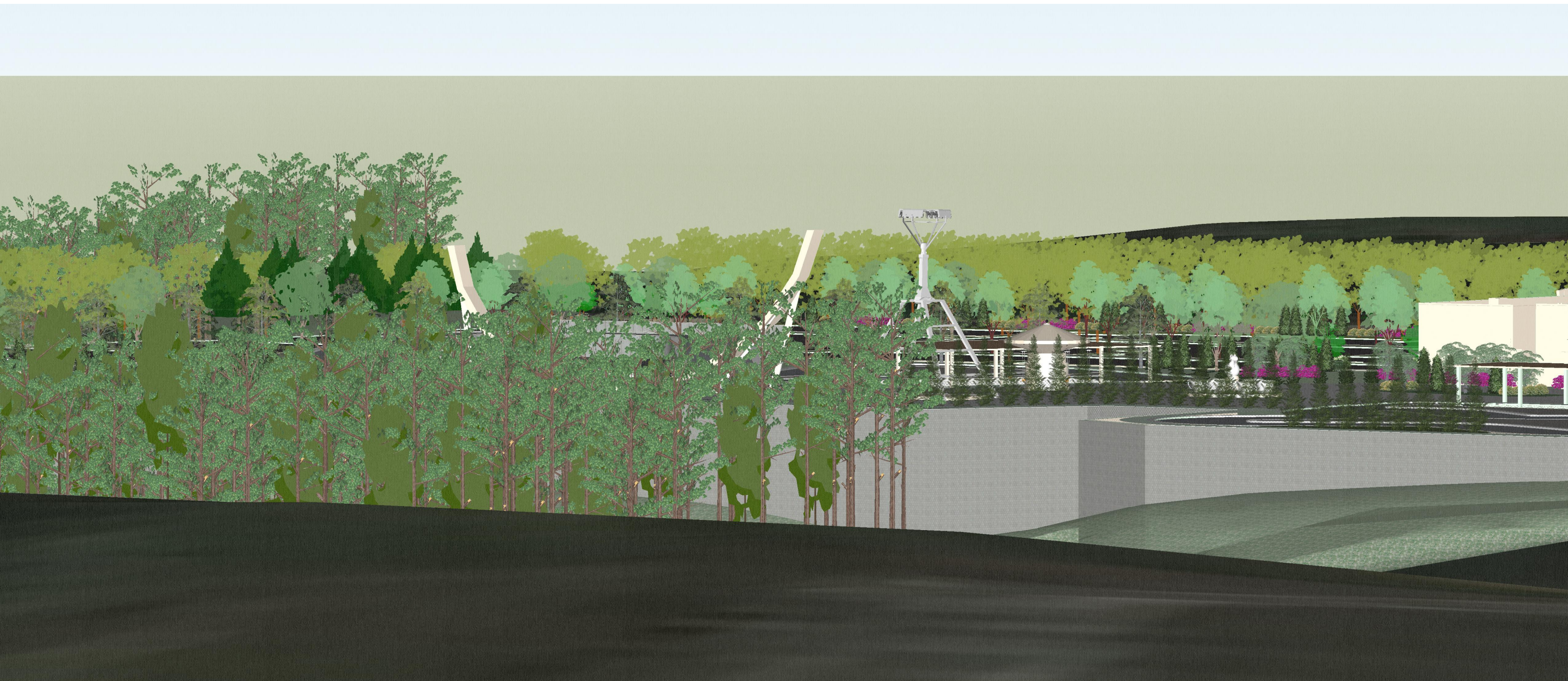
FRANKIES FUN PARK HUNTERSVILLE, NC