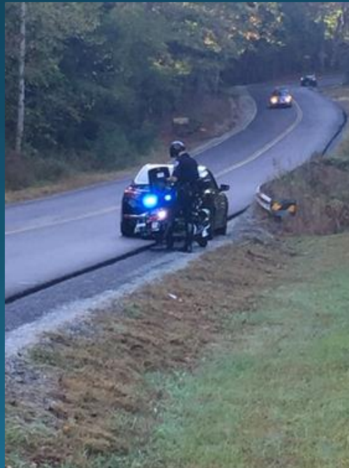
HPD Motorcycle Program (Tactics not Staffing)